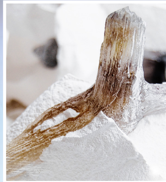
06. Finalisation: cutting out of the vents and casting cones, then the object is carefully polished to improve the final brightness.