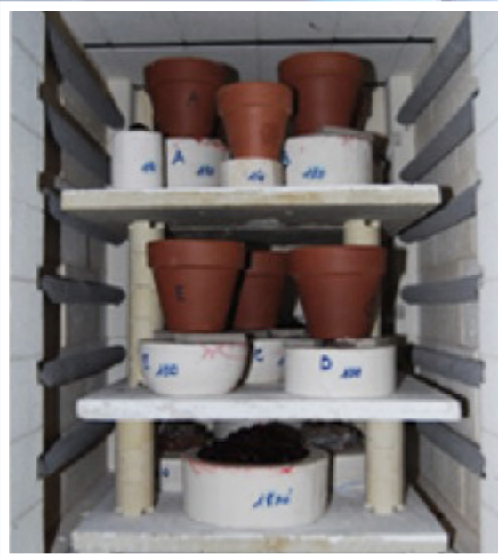
04. The mould is then placed in a kiln with a temperature between 800 and 900 degrees Celsius (1472 - 1652 F). The mould is gradually cooled to avoid thermal shocks.