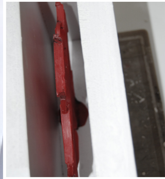
03. The wax is steamed to be removed from the plaster in order to have an imprint of the object.