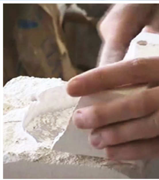
05. At room temperature, the plaster mould is removed to release the object.