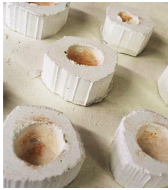
02. Making of a mould with plaster and refractory materials especially for glass melting.